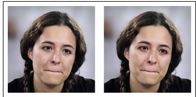
Figure 1. Participants responded to pictures of crying individuals (right) and to pictures of the same individuals with tears digitally removed (left).

The study was approved by the Ethics Review Board of the School of Social and Behavioral Sciences, Tilburg University